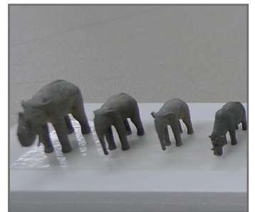
Objet 3D printer was instrumental in winning project to design safari zoo