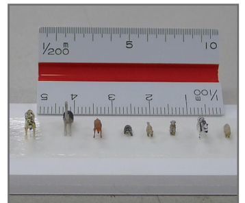
The ability to produce highly detailed models provides competitive edge.

www.siam3dprinter.com | www.applicadthai.com