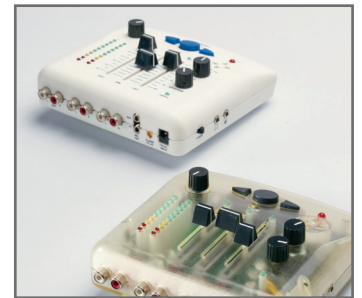
NNL uses rubber-like material to evaluate the ergonomics of buttons and controls.

"The Objet Eden 3D Printer helps us easily and quickly meet our customers' requirements," said Svein Reidar Rasmussen, hardware developer at NNL. "During development and design of a new product, we use rapid prototyping to show us how the final product is going to look and feel." NNL uses prototypes to make decisions and solve problems in cases where other external products are used in combination with its solutions.