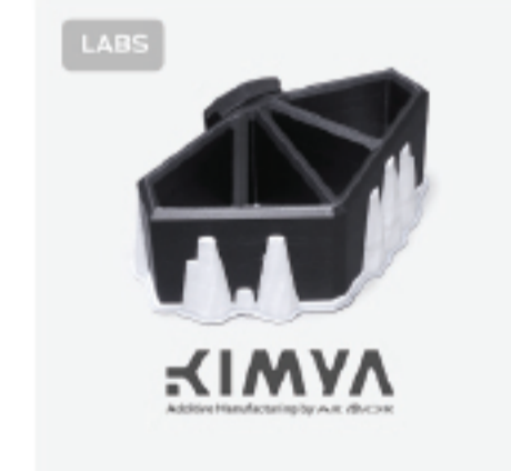
ABS CARBON FIBER