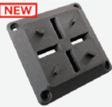
NYLON CARBON FIBER