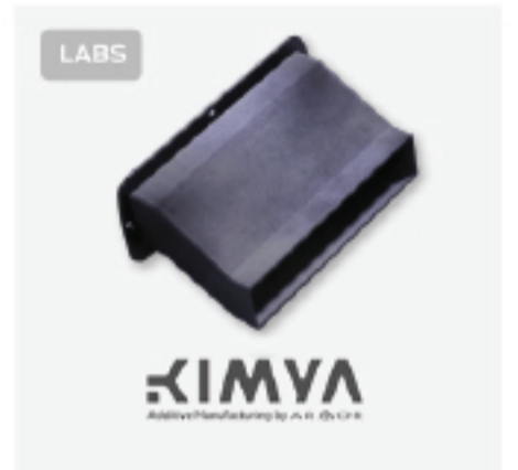
PETG CARBON FIBER